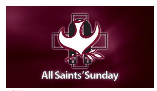
All Saints Day 2019

Phílippians 1:3 I thank my God upon every remembrance of you.